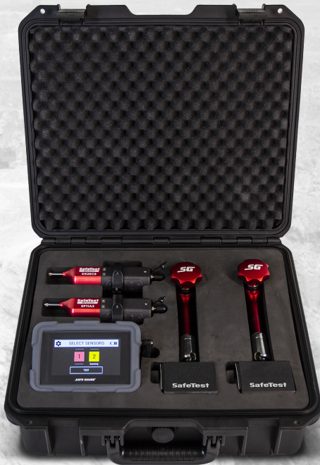
SafeGauge DI2 Kit