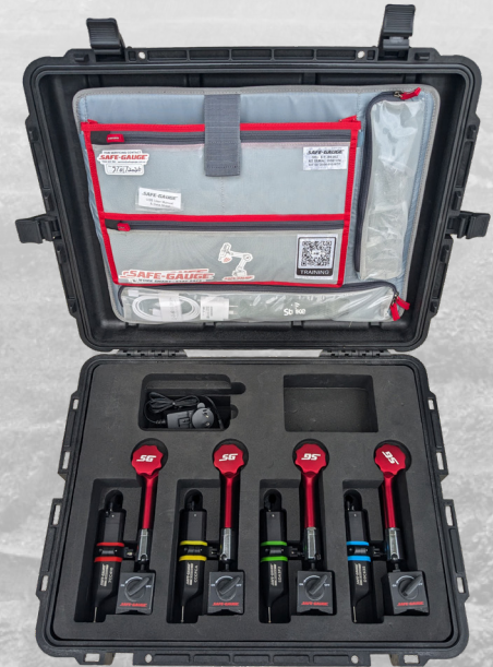
SafeGauge DI-04 Kit

Custom kits and accessories are available on request.