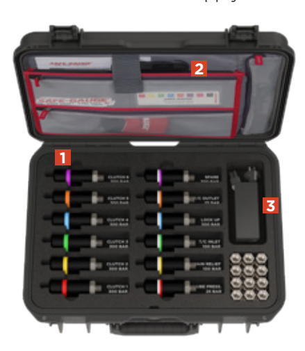
Safegauge 12 Channel PT Kit PT-12