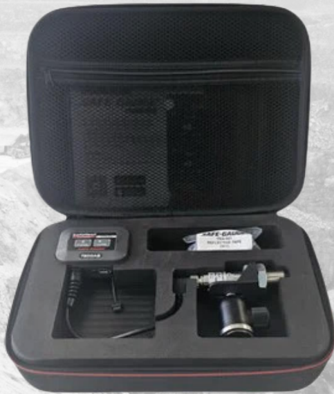
SafeGauge TM-01 Kit