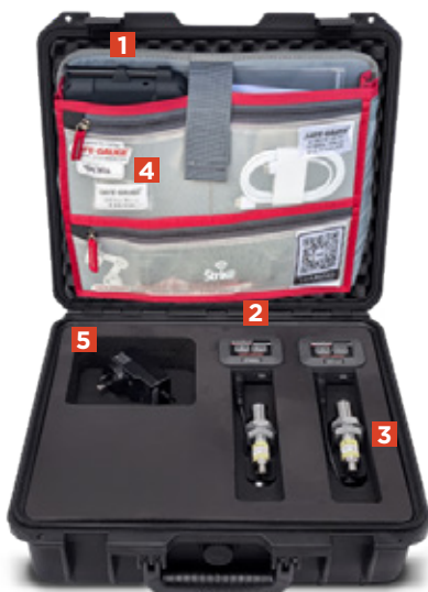
Safegaugage 2 Channel TM Kit TM-02