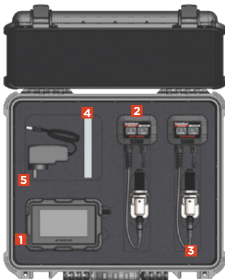
SafeTest TM 2 Channel Kit