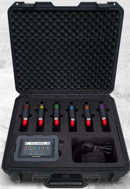
SafeGauge PT6 Kit