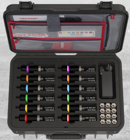
SafeTest PT-12 Kit

Custom kits and accessories are available on request.